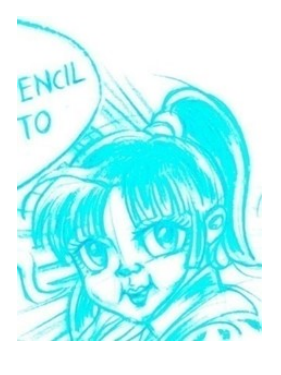
Draw a rough sketch using the SKETCHER pencil.