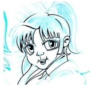
Then ink over the basic drawing. Notice the soft lead is not waxy.