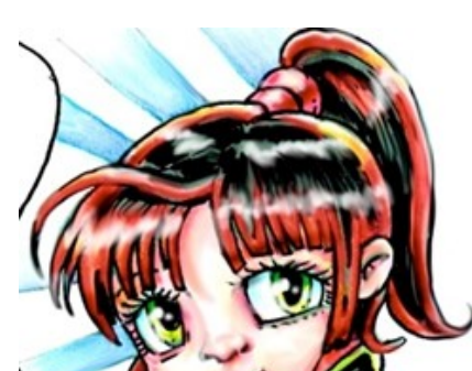
The coloring process can now be completed over the blue line sketch or over a newly printed drawing from the scanned image or photocopied image.