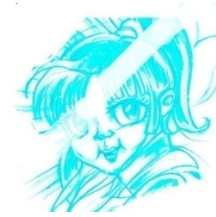
Now erase a small area. See it doesn't smear.