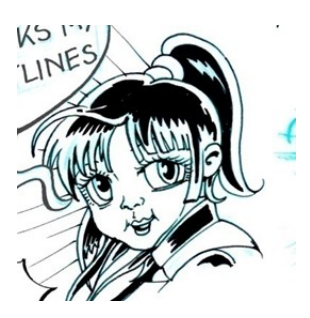
When the drawing is scanned or photo reproduced the blue lines disappear!